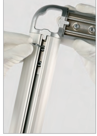
insert and fix with screw